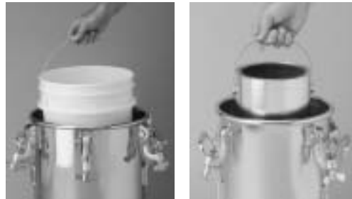
Binks 5 gallon tanks (above) accept standard and imperial 5-gallon shipping pails. 2 gallon tanks accept U.S. and Canadian 1-gallon pails only.

Maximum Working Pressure . . . . . 110 PSI Fluid Outlet, Top . . . . . 3/8" NPS Fluid Outlet Plug, Bottom . . . . . 1" NPT Air Inlet . . . . . 1/4" NPS